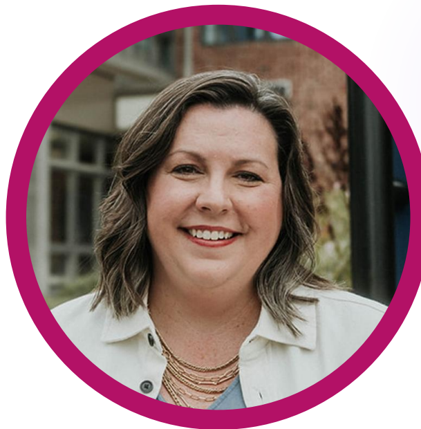
Heather Renter Heritage Community of Kalamazoo