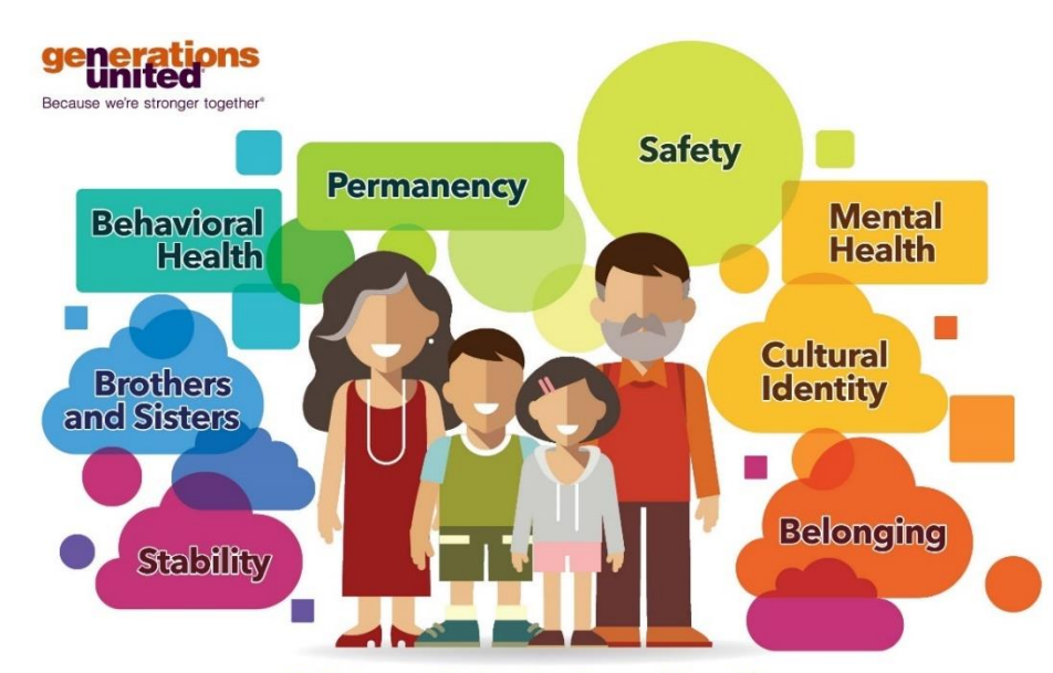
Children Thrive in Grandfamilies

Imagine you are a child. In the middle of the night, your mom drops you off at your grandma's house to live. Your mom and dad can't care for you anymore. Their opioid and alcohol use have made it impossible to parent. You're glad to be with your grandma because it feels safe and comfortable at her house, but you're worried about some things. Where will you go to school? How will you get your asthma medicine? Can your grandma get it for you? Will your mom and dad be okay?