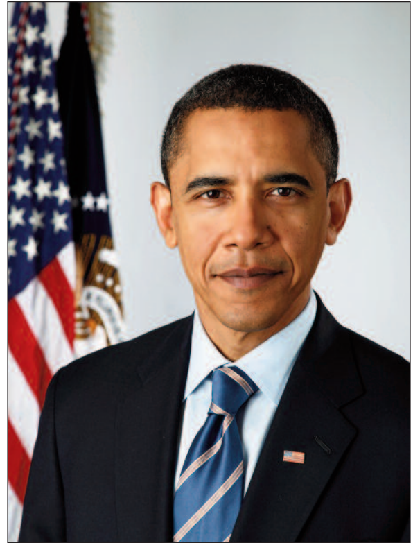
Official Portrait of President Barack Obama