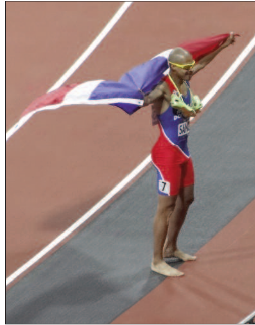
Felix Sanchez victory lap of honour, London 2012 Olympics